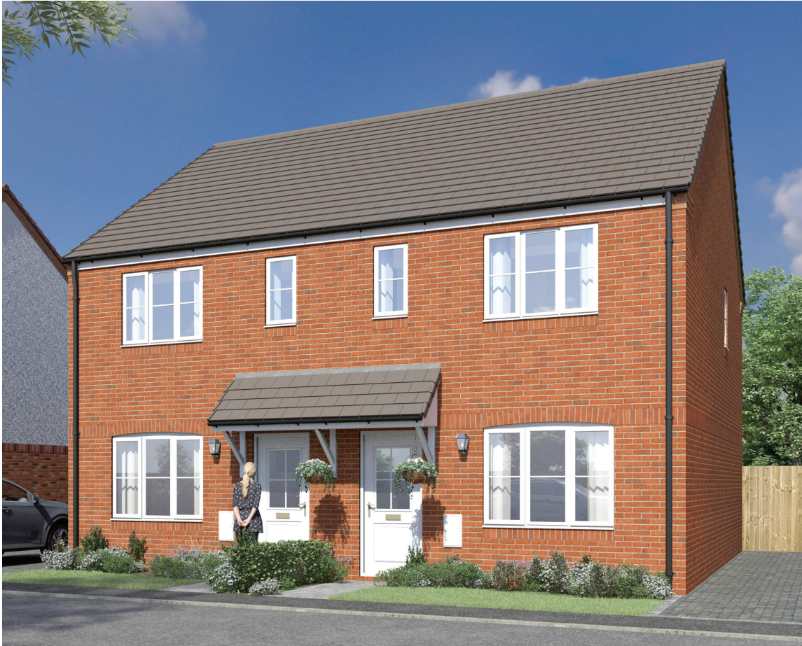
Computer generated image of plots 41 & 42.