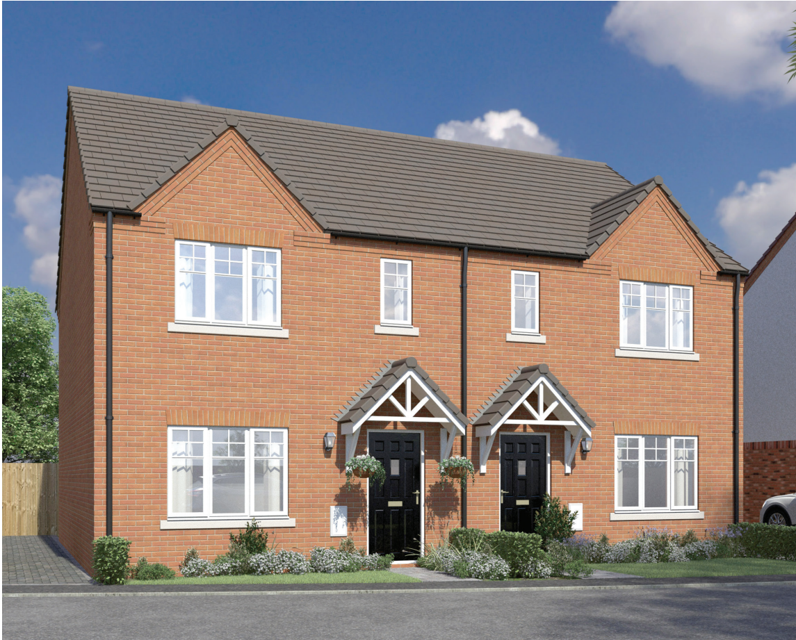
Computer generated image of plots 37 & 38.