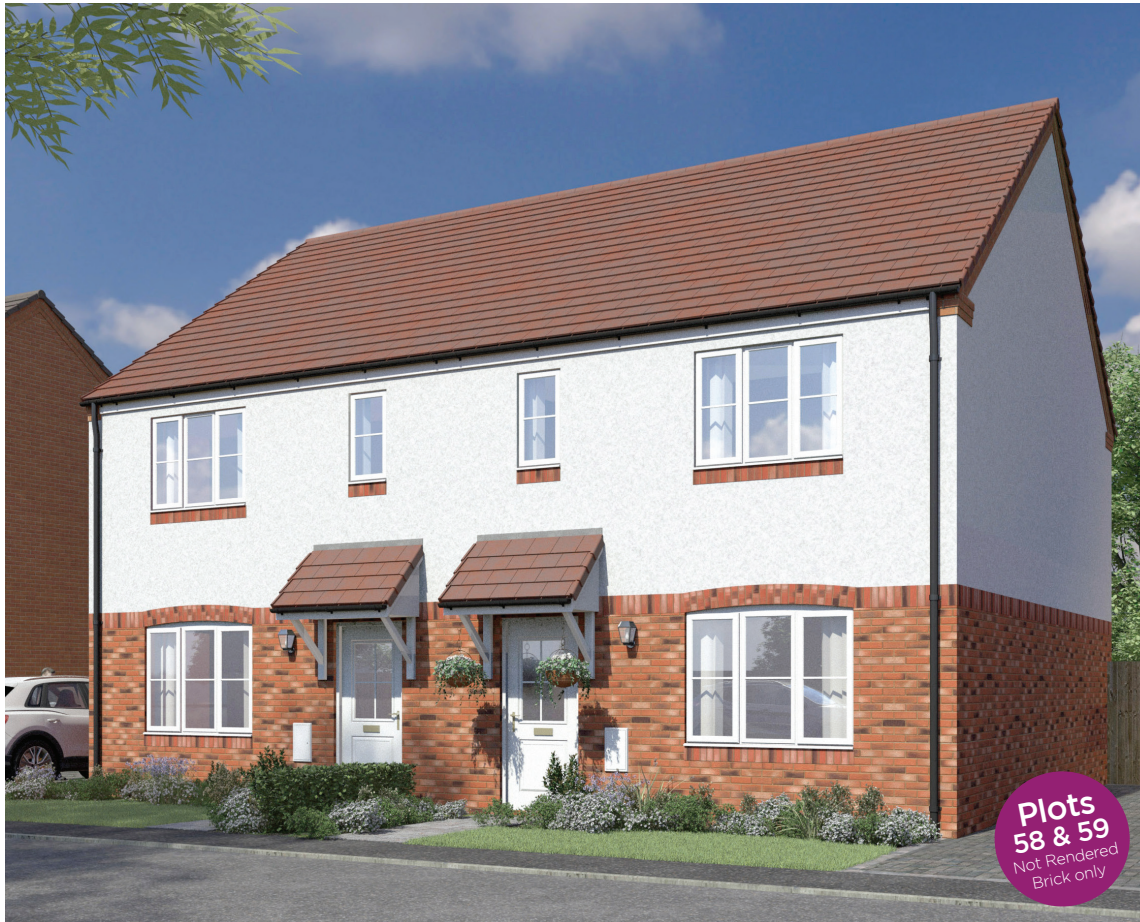
Computer generated image of plots 39 & 40.