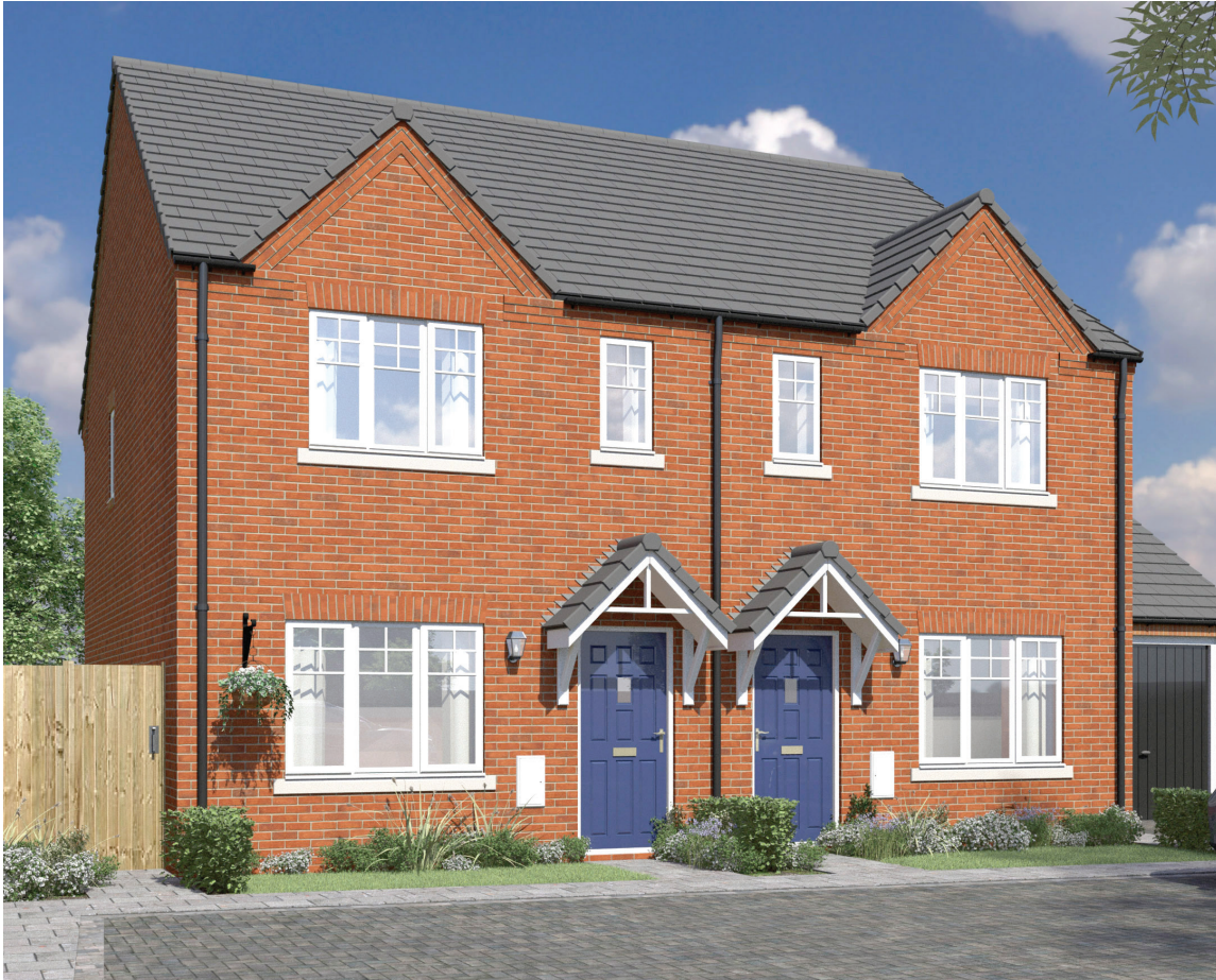
Computer generated image of plots 27, 28, 48 & 49.